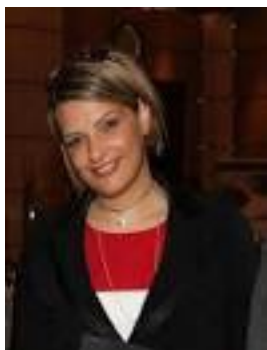
Photo (if available):

Position in the Entity: Senior Manager, CEO